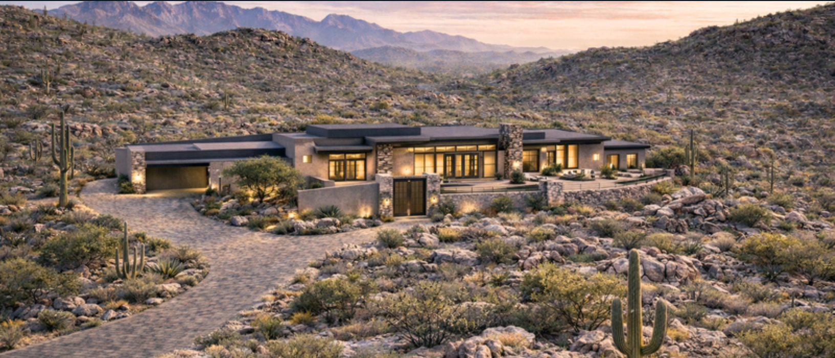
Lot #27 Conceptual Rendering

With no spec home currently built, Lot #027 offers flexibility for buyers who wish to design from the ground up or explore semi-custom luxury concepts that offer an efficient, curated building experience.